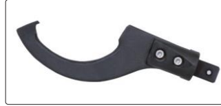
type C (optional)