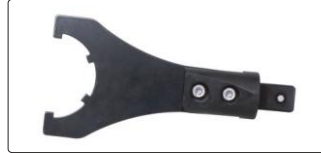
type UM (optional)